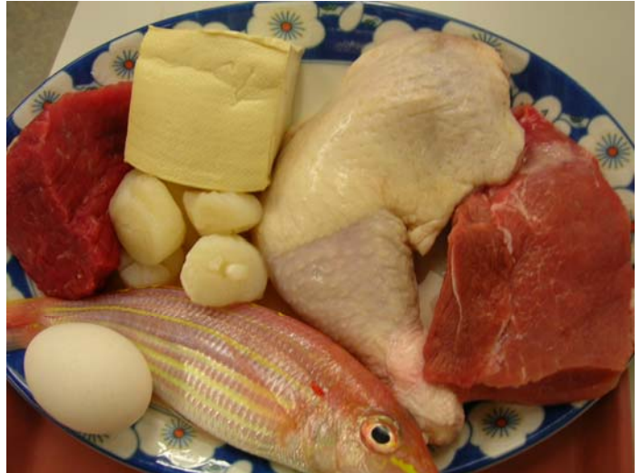
Patients should maintain a high protein diet